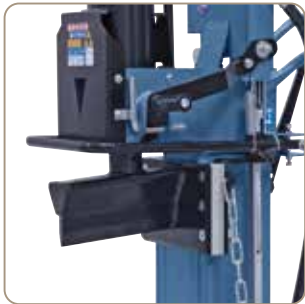
Large splitting wedge features solid, durable plastic guide.