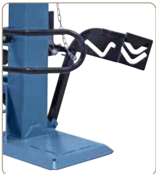
For raising of heavy logs complete with mechanic log lifter.