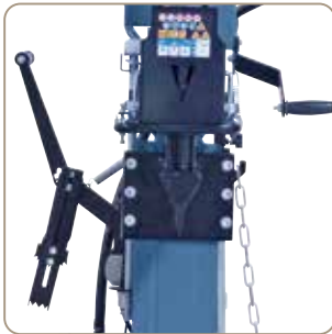
Two-handed safety operation for safe work, forward speed alternatively fast or slow.