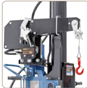
Optional available: Hydraulic winch