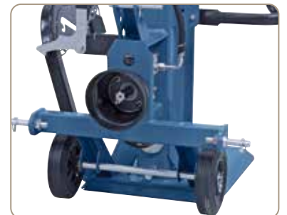
Serially with three-point attachment according to cat I/II and pins