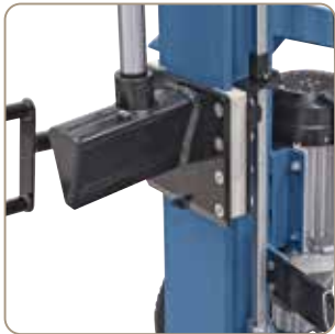
Large splitting wedge features solid, durable plastic guide.