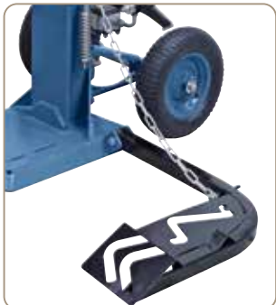
For raising of heavy logs complete with mechanic log lifter.