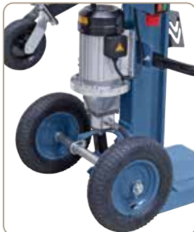
Large rubber wheels allow for easy transport (HS 16 E).