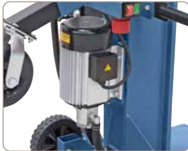
Powerful electro motor and high quality hydraulic pump.