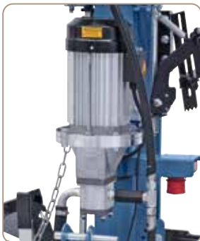
ZE-models with powerful electro motor and high quality hydraulic pump.